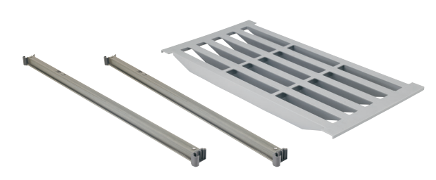
Vented Shelf Kit includes two Traverses and Vented Shelf Plates for one shelf.