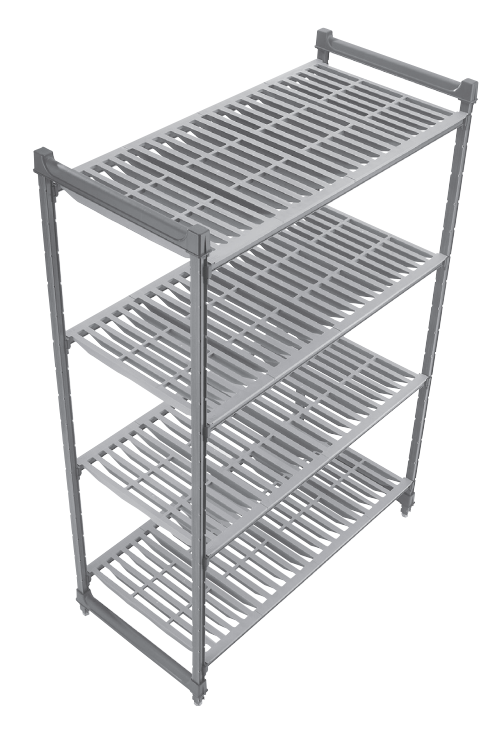
Four Shelf Unit built from 2 Post Kits and 4 Shelf Kits.